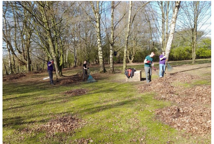
Volunteers collecting 2 year's worth of leaves!

Just like our Groups and Units, the campsite has been deeply impacted by the pandemic. Not only have we not had the regular stream of bookings that create the income that we normally re-invest in the site; the national lockdowns meant we've not been able to undertake the regular maintenance we normally would.