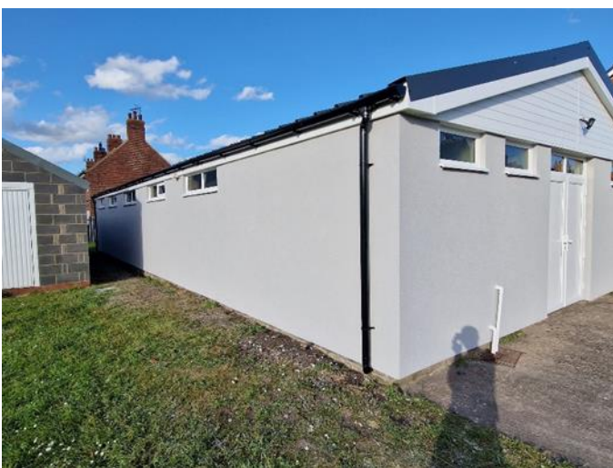
New look Olympia!

The most exciting news has been obtaining the grant funding to finish off the exterior projects on the site. You will remember that over 2020/21 we removed and replaced the asbestos roof with an insulated composite boarding, we have finished the task of replacing the windows and doors over the last year and in the last few weeks have seen the site fully wrapped in insulated boarding and rerendered. We have also obtained funding to create wheelchair access for the site, which will be completed in the next few months.