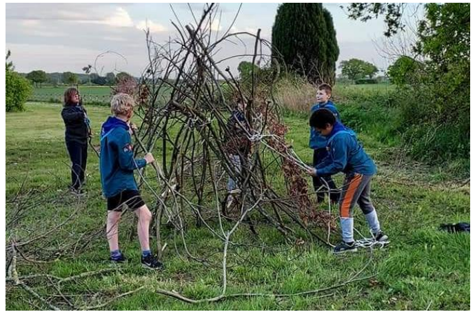
Scouts building shelters

have awarded Top Awards, 4 Chief Scouts Bronze, 1 Silver and 2 Gold this year!