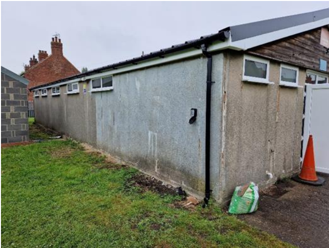
Olympia prior to the wrap and render

We've also seen a couple of small-scale camps and expeditions use the site during the period that Tamarak has been closed, meaning that we have been able to generate a small additional income from weekend events.