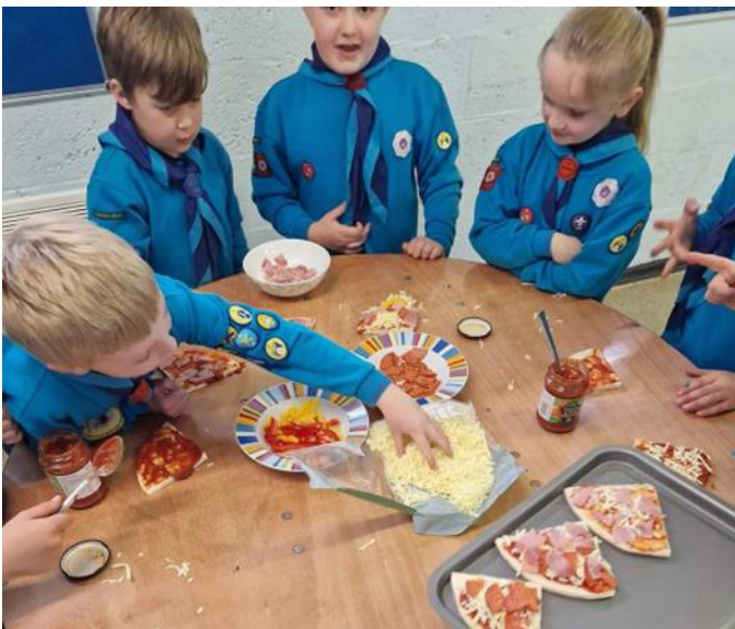
Beavers making pizza!

Our most exciting news in the last year has been the opening of our Squirrel Drey with the support of some of our existing leaders we now have 13 new Squirrels, all ready to be invested into the Group in early June. On top of that our other sections have continued to grow with a full Beaver Colony, 18 Cubs and 21 Scouts. This has assisted us financially as a group and we now have replenished the funds which we lost during the lockdowns and returned the group to a financially stable base.